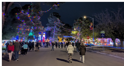
Christmas festival in the Winter Haven.

Tucson is placed north of Nogales in Sonora state in Mexico. Thus, the culture in Tucson is influenced by Mexican culture a lot. In particular, tacos and other Mexican food are popular in Tucson. There are many Mexican immigrants in Tucson, and they speak Spanish everywhere.