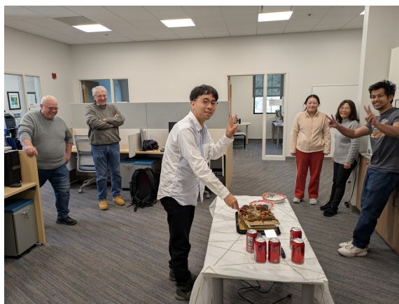
Picture of a farewell party for me.