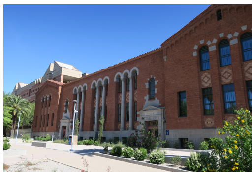
Old Chemistry Building in the University of Arizona. The Brédas' laboratory is on the third floor of this building.

In the first month, I studied about the prior theories for the vibronic model in mixed-valence systems. 3,4 Then, in the second month, I put this into the framework of the crude adiabatic (CA) representation, constructing two-LE-state model, which is the vibronic model including two LE states. Here, I found that the CA representation was effective to describe the vibronic structures of the mixed vibronic states compared to the Born–Oppenheimer representation. The two-LE-state model could reproduce the lineshape and temperature dependence of the PL spectrum in the ITIC film, in which