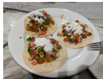
Tacos made by me.