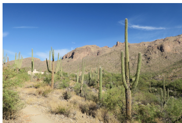
Foot of Mt. Kimball.