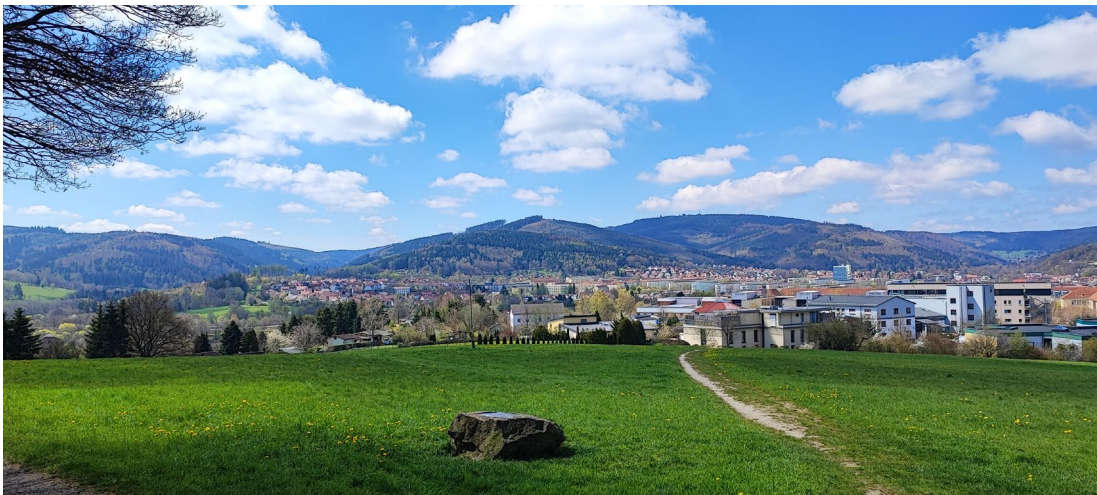
Fig. 1: A picture of Ilmenau where I stayed during my internship.

On the other hand, this internship was the first opportunity for me to stay in a foreign country for more than a week. Hence, there were many challenging things in my life during this period. This point will also be elaborated on later.