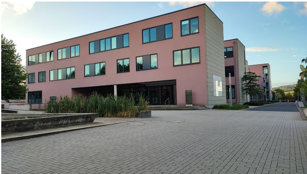
Fig. 2: The building including the department of automation engineering, TU Ilmenau. The name of the building is Zusebau in German.

The offices and the laboratories of the department are in the building named Zusebau, whose picture is shown in Fig. 2. Note that the building is named after Konrad Zuse, the well-known German computer scientist, and, interestingly, most buildings in TU Ilmenau are named after famous scientists, such as Newton, Kirchhoff, Helmholtz, Faraday, and Heisenberg.