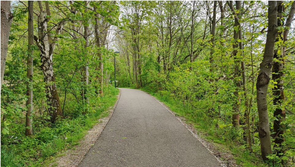
Fig. 5: Plenty of nature in Ilmenau

Note that it took me two months to finish all these steps.