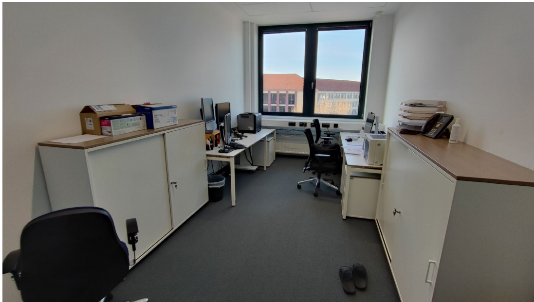
Fig. 3: My office at TU Ilmenau.

My office was on the third floor of Zusebau, whose picture is shown in Fig. 3. This room was shared with another visiting doctoral student from China from July 2023. Before that, I was the only occupant of this room! It was a very convenient environment, which is hardly realized in Japanese universities. It helped me to focus on my research, such as thinking about new algorithms or theories, writing some things, and learning new things.