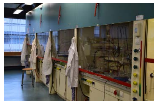
Clean lab and fume hoods

After revealing the winners of 2019 Nobel Prizes, a party with simple dinner