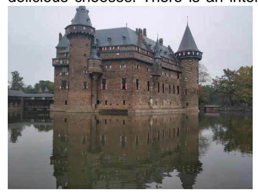
Kasteel De Haar in Utrecht

found that he is an expert in supramolecular field. When I arrived at the Netherlands, I just felt so uncomfortable because of the bad weather and a big difference from Asian countries. After a couple of days, however, I started to love this place, which has beautiful large area of pasture, cute animals and delicious cheeses. There is an interesting thing in the Netherlands. The first