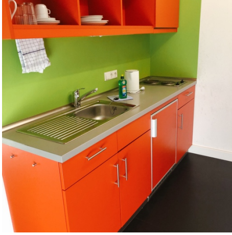
My room and the colorful kitchen