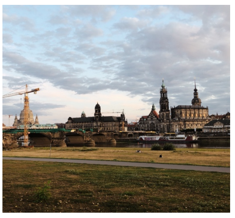
Old town of Dresden