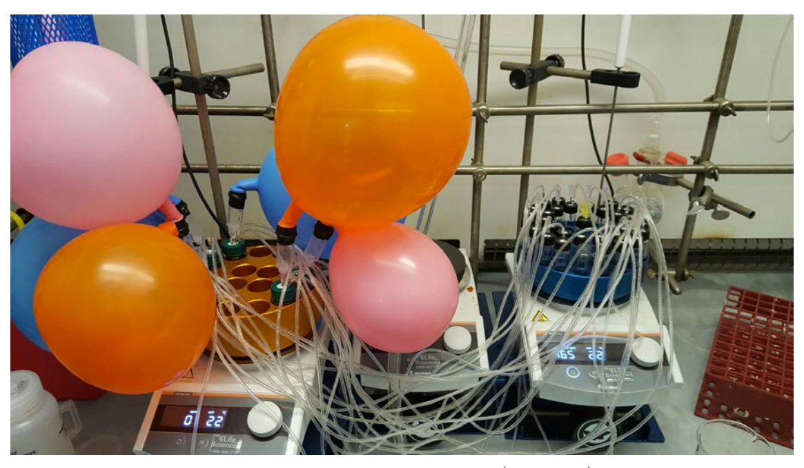
Pic 2a. Oxidation reactions by me (2016/10/7)