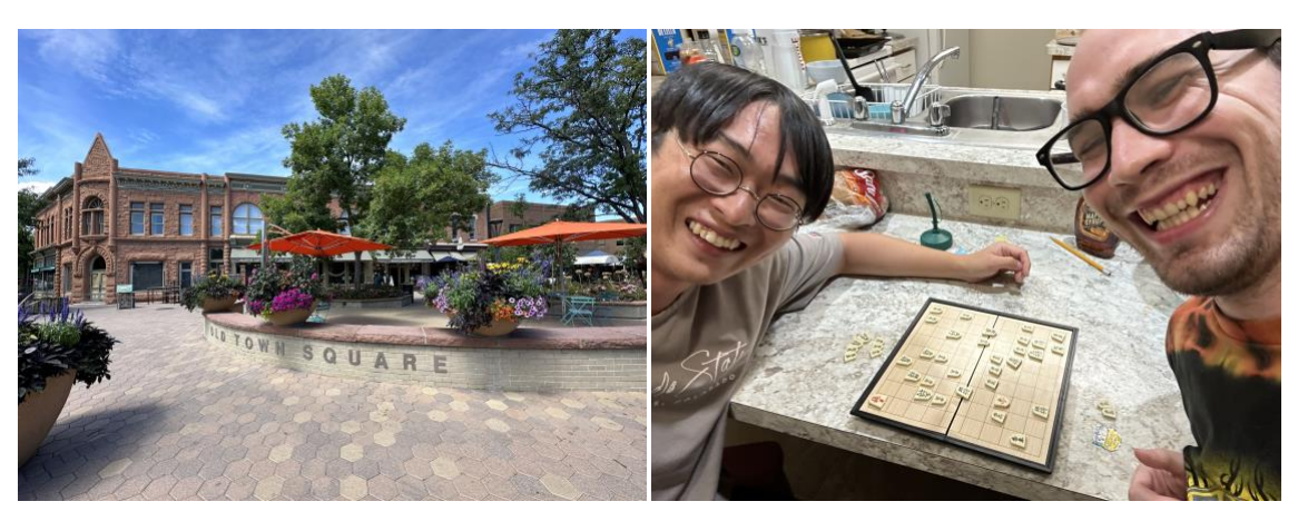
Figure 2. Photo of Old Town in Fort Collins.

Fort Collins is a very beautiful city located at the foot of the Rocky Mountains ( Figure 2 ). The campus of CSU is surrounded by a rich nature and I could find squirrels, rabbits, prairie dogs, and eagles. Fort Collins is safe and comfortable place to live with free buses. I lived in CSU International House with a roommate who is from San Diego in California State and studies history and education ( Figure 3 ). We shared our own culture and for instance we enjoyed shogi (finally I lost!). This room sharing must have greatly improved my English and understanding about American culture and history. Through the one-day trips provided for international students, and I could make many