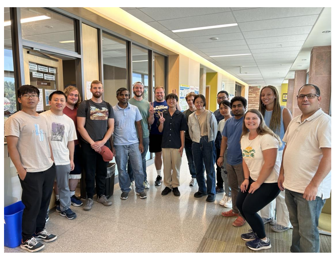
Figure 1. Photo with the labmates.

I visited the Chen Group at Colorado State University (CSU) because Prof. Eugene Chen is a great chemist in the field of synthetic polymer chemistry ( Figure 1 ). The recent research topics of the group are mainly Lewis pair polymerization (LPP) of (meth)acrylate monomers for one-shot block copolymer synthesis and cyclic polymer syntheses and development of circular polymer materials. During this internship, I worked on the LPP of di(meth)acrylate monomers toward synthesis of the cyclic cyclopolymers, which have a macrocyclic backbone and repeating small cyclo-units on