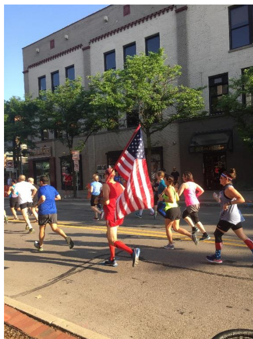
Pic. 4. A marathon competition on the Independence Day.