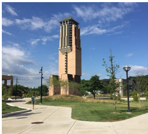
Pic. 1. North Campus of the University of Michigan.