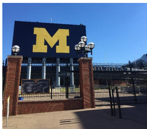
Pic. 3. Michigan Stadium in Ann Arbor.

University of Michigan is located at Ann Arbor. Since Ann Arbor is a quiet and beautiful city surrounded by nature, I could concentrate on my research well. In Ann Arbor, I was surprised that the town was full of school logos of the University of Michigan. Many people wear T-shirts with the school logos, and they support the college football team of the University of Michigan. During football season, there are football games at the Michigan Stadium. Michigan Stadium (Pic. 3) is the biggest stadium with a capacity of 100,000 people! Unfortunately I could not watch football games at this stadium, but I was able to see a part of American culture.