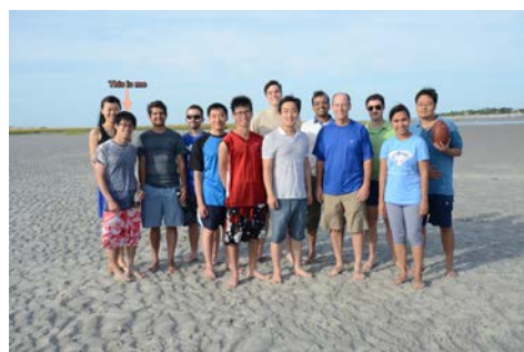
Fig 1. A group photo of Rutledge group at Essex river tour

The daily life in the Rutledge laboratory was slightly different from my home laboratory in Japan in that most of the members were international and about half of the members were doctor course students or post doctors. Since